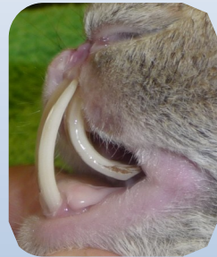
Badly overgrown incisors. These teeth never stop growing.