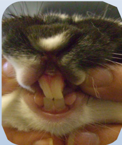
Normal healthy incisors.

Roughage is essential for wearing down the teeth, which never stop growing. Teeth that are not worn down adequately will become overgrown, misaligned and may develop sharp points, which can traumatise the mouth.