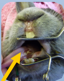
Ulceration caused by sharp points on overgrown molar teeth literally cutting into the tongue.