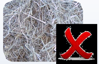
Low-quality, dusty hay is of no nutritional value