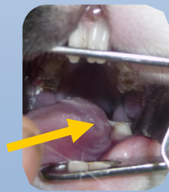
Sharp point on molar caused by uneven wear of teeth.