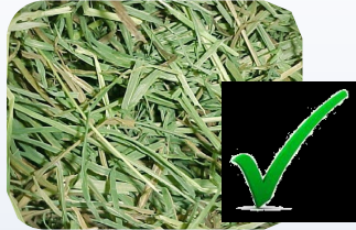
Good-quality Timothy hay is recommended