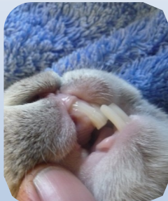
Misaligned incisors – the upper teeth are sitting behind the lowers, rather than the other way around.